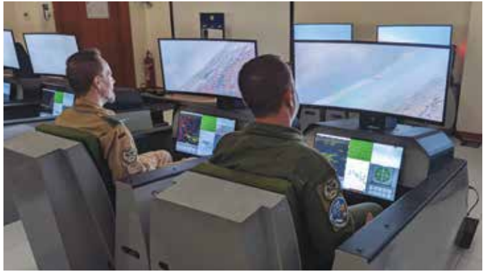
Two of 30 PTMTs in the NATO Tactical Leadership Programme (TLP) classroom for fighter pilot simulation training at Los Llanos Air Base, Albacete, Spain.

Using notional aircraft hardware represented by touchscreens for conducting air-to-air or air-to-ground training scenarios, the PTMT can be configured for training for current 3rd and 4th generation combat aircraft currently used by NATO nations by easily changing the position of the specially-designed, patent-pending, flight control stick between side-stick and center-stick positions.