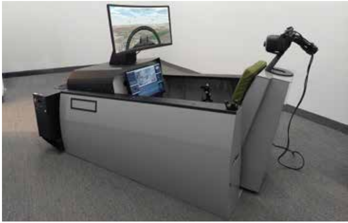
Part Task Mission Trainer (PTMT) with Varjo XR-3 mixed-reality system.

With this cost-effective, easy-to-assemble/break down modular plug-and-play system, pilots can practice to improve skillsets such as gun runs and strafes, building muscle memory without requiring the use of an actual airframe. A pilot in the PTMT can manage complex air-toair scenarios -- taking virtual control of any constructive player at any time, triggering scripted behaviors, and employing aircraft systems that directly mimic the capabilities of their real world counterparts, all while interacting with controls in the same manner as they would in an actual aircraft. The simulator is currently in service in the NATO Tactical Leadership Programme (TLP) at Los Llanos Air Base, Albacete, Spain.