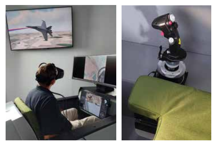
Left: VRSG view on the wall-mounted monitor shows the ability to track the pilot's head position and orientation, track the gaze vector using the Varjo XR-3's pupil tracking functionality, and then visualize the gaze of each eye independently as a color-coded 3D cone. Right: Adjustable (patent pending) control stick for side- or center-stick positioning.

Close-up of the PTMT cockpit control panel, which in this case is not aircraft specific. The flexibility of BSI MACE's multifunction display (MFD, upper left) enables the setup of various panels and training scenarios. Controls shown here include MACE's up front controller (UFCD, top center), VRSG's simulated sensor feed (top right) with an AN/DAS-1 overlay (slewed via one of the HOTAS throttle controls) along with MACE's artificial horizon, altimeter and HSI (bottom left), moving map (bottom center) and radar warning receiver (bottom right). The UFCD interfaces with the MFD to enable input of mission essential data and control of DIS radios.