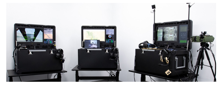
The PJFT can connect to the Deployable Joint Fires Trainer as additional observer and instructor stations.

The PJFT runs on 100-120 V and 200-240 V power at 50-60 hz and the power cord can be replaced with regional specific connectors.