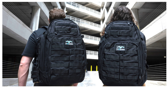
The PJFT is comprised of an IOS Backpack and a JTAC Backpack.

The PJFT provides full-spectrum mission training as a standalone capability or as a portable component of the fullyaccredited Deployable Joint Fires Trainer (DJFT) or similar JFS ESC accredited simulators. The PJFT is directly interoperable with the current U.S. Air Force JTAC training program of record system, the Joint Terminal Control Training and Rehearsal System (JTC TRS).