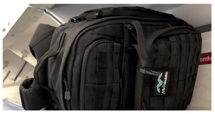
The PJFT backpacks are commercial airline carry-on approved. The PJFT can also be shipped in a single protective Pelican case. All components are air freight shippable.