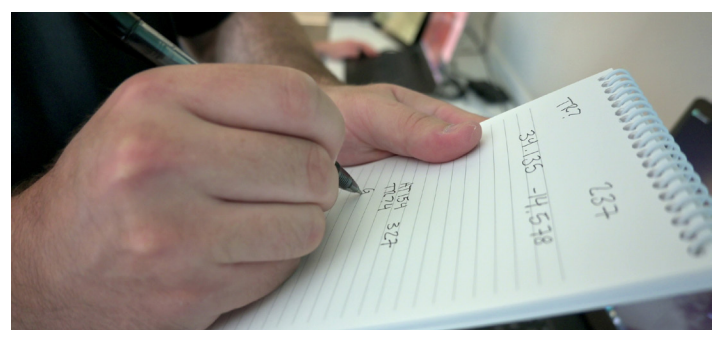
Mixed-reality simulation allows the student to read and write without the need to remove the HMD.

The PJFT is delivered with a Samsung S23 Tactical Edition device ready for the GOTS Special Warfare Assault Kit (SWAK) software. The device allows the JTAC trainee to view the tactical picture on a real-world end user device, including geospatial information, MACE-generated 9-line targeting comms and Link 16 and VMF data. Implementation of SWAK is the customer's responsibility.