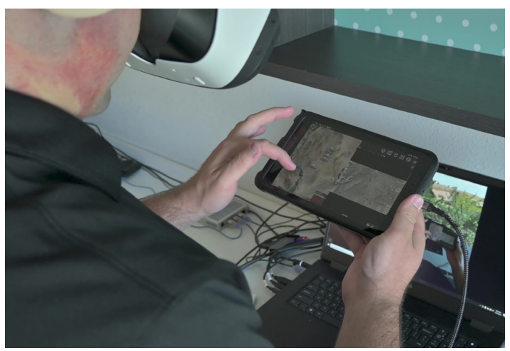
The JTAC Backpack provides an ultra-portable mixed-reality training device that supports real-world video pass-thru. The observer can interact with real end user devices and stay immersed in the virtual environment.